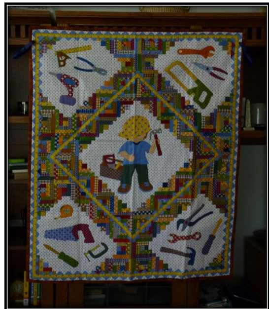
Charity quilts by guild members