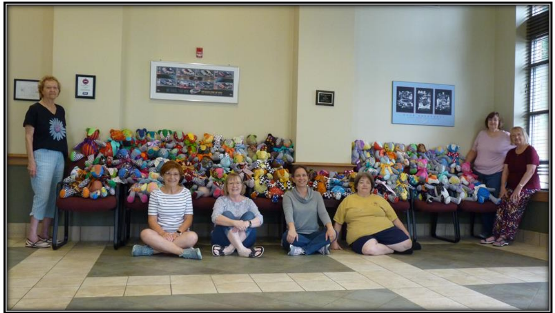
Victory Junction Bears