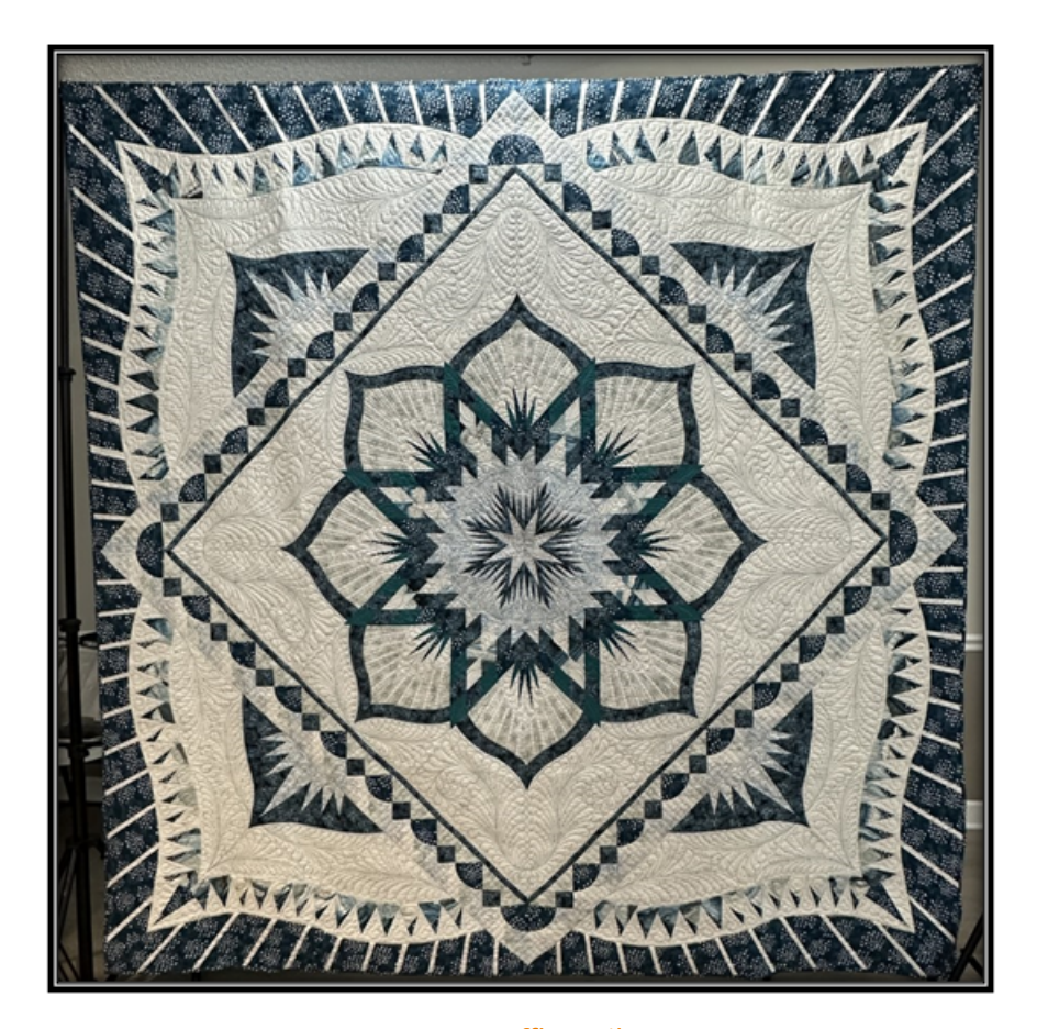
2023 Raffle Quilt