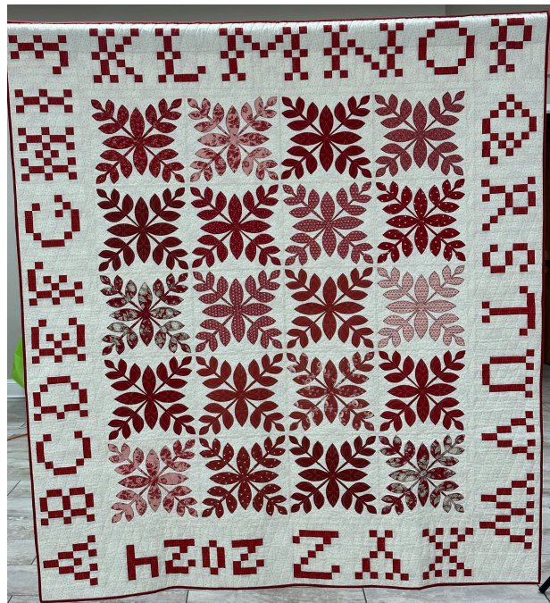
2024 Raffle Quilt