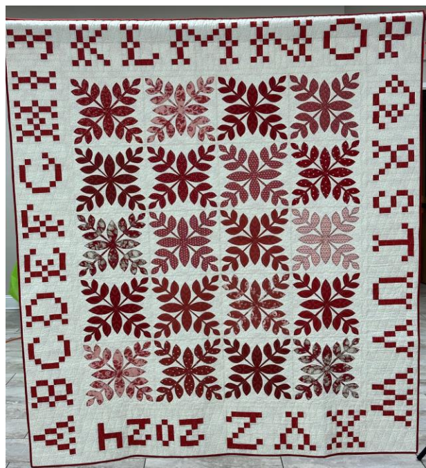
2024 Raffle Quilt